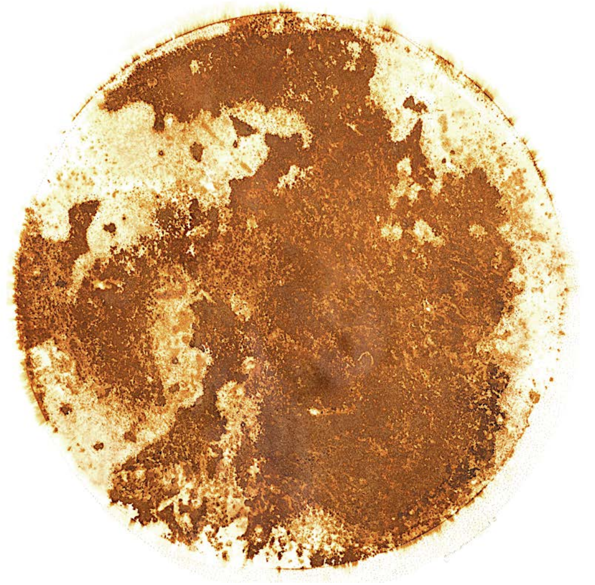
GILLIAN McFARLAND Units of Time , rust print on paper, 55 x 35cm