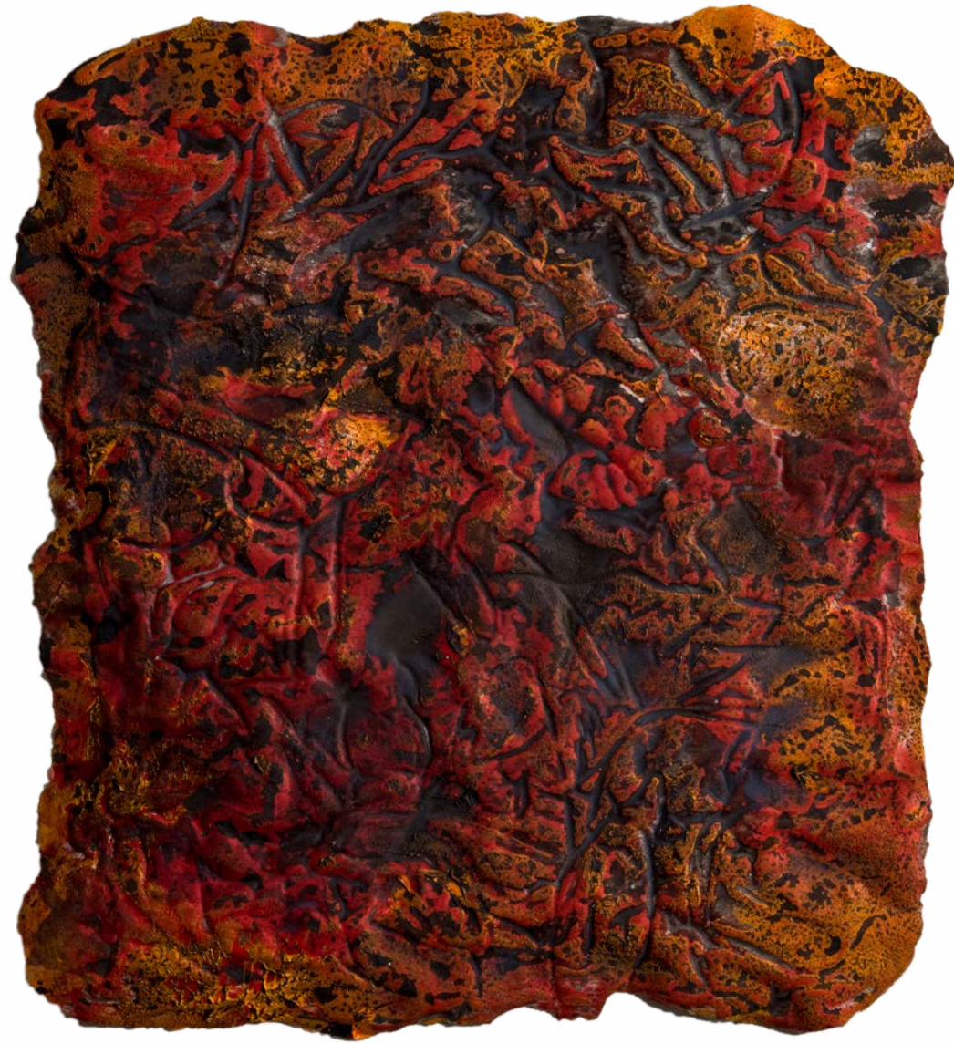
IONE PARKIN RWA Magnetic Turmoil , mixed media on paper, 40 x 34cm