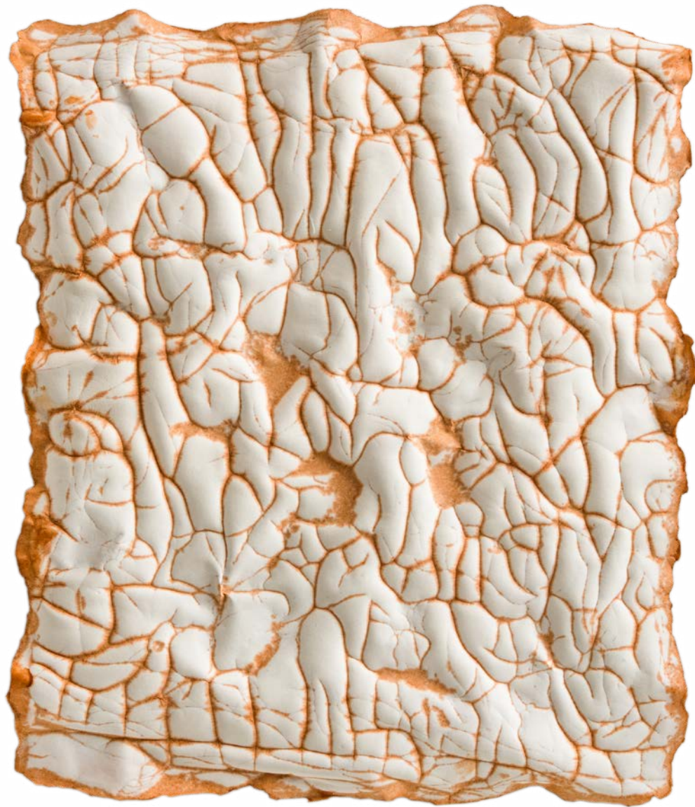
IONE PARKIN RWA Mars Study , mixed media on paper, 40 x 34cm