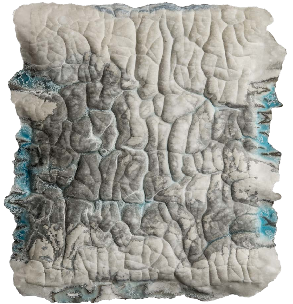
IONE PARKIN RWA Planet Sample , mixed media on paper, 40 x 34cm