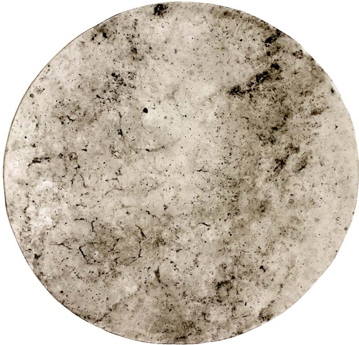
GILLIAN McFARLAND SSA April Moon , collagraph on punctured paper, 55 x 35cm