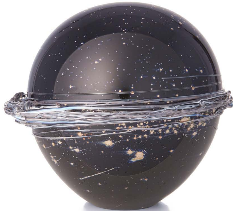
GILLIAN McFARLAND SSA Planetary Spin , glass and nitrates, approx. 20cm