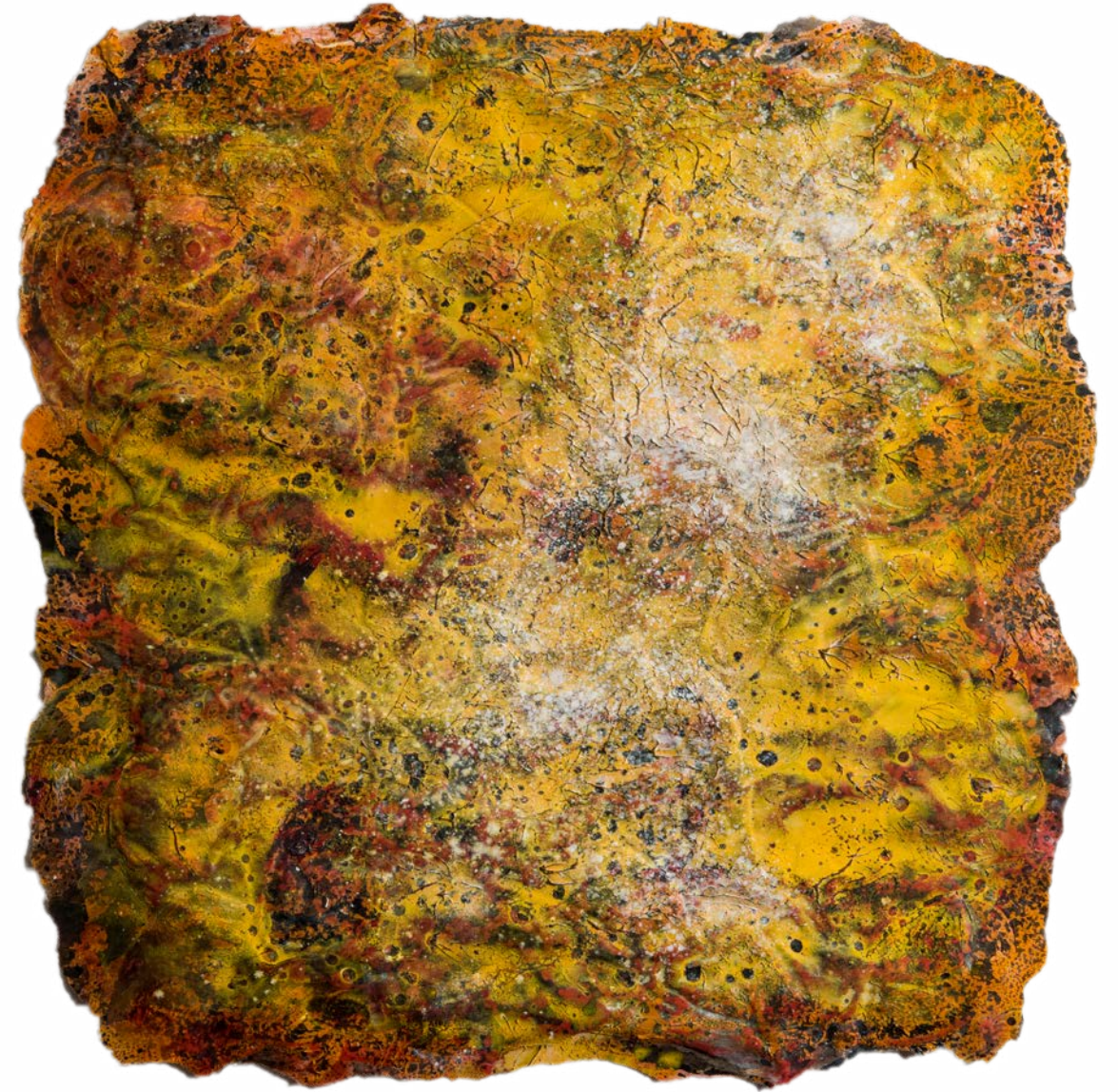
IONE PARKIN RWA Sulphur Crust , mixed media on paper, 40 x 34 cm